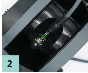
2 Plugging in the cable to the built-in male connector.