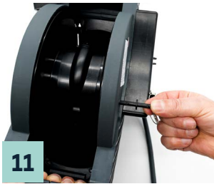
11 Loosening the nut from the locking pin of the pre-tensioned drum reel.