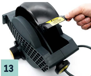
13 Attaching the cover at the rear to the installed cover guide.