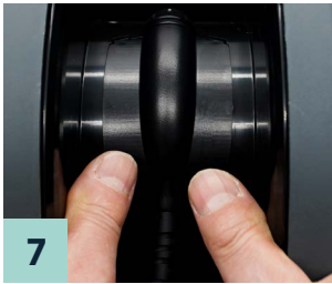
7 Locking the cover by pressing it down.