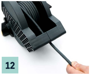
12 Initial manual winding of the connecting cable.