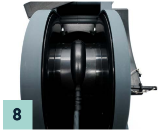
8 Final cable installation.