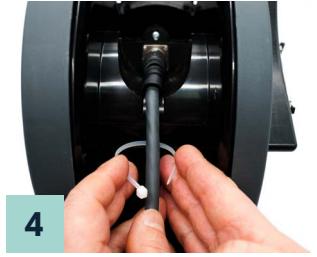
4 Closure of the cable tie around the cable outer jacket.