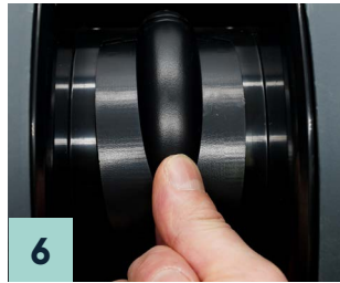
6 Inserting the plug cover.