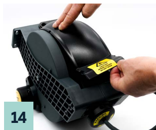
14 Inserting the middle guide tabs by initially attaching the cover at a slight angle from the side and then final snapping into place.