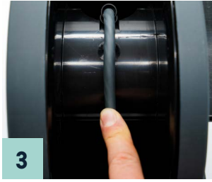
3 Free adjustment of the strain relief.