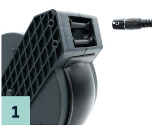
1 Passing the original connecting cable through the guide rollers.