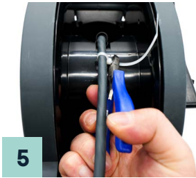
5 Cutting off the excess cable tie.