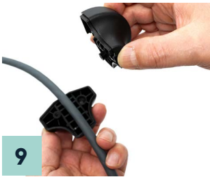
9 Attaching the cable pull stopper to the connection cable, mounting it approximately 1-1.5 meters away from the handheld device.